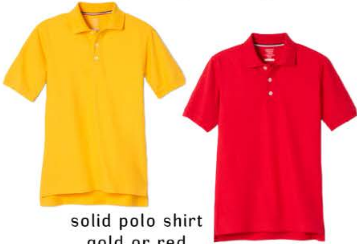
solid polo shirt gold or red school logo