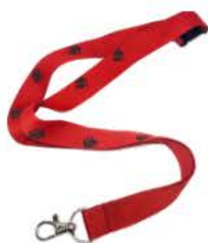
SCHOOL ID LANYARD