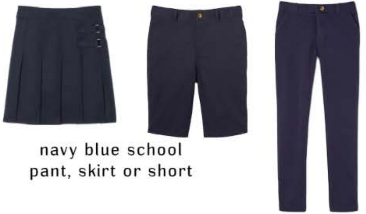
navy blue school pant, skirt or short